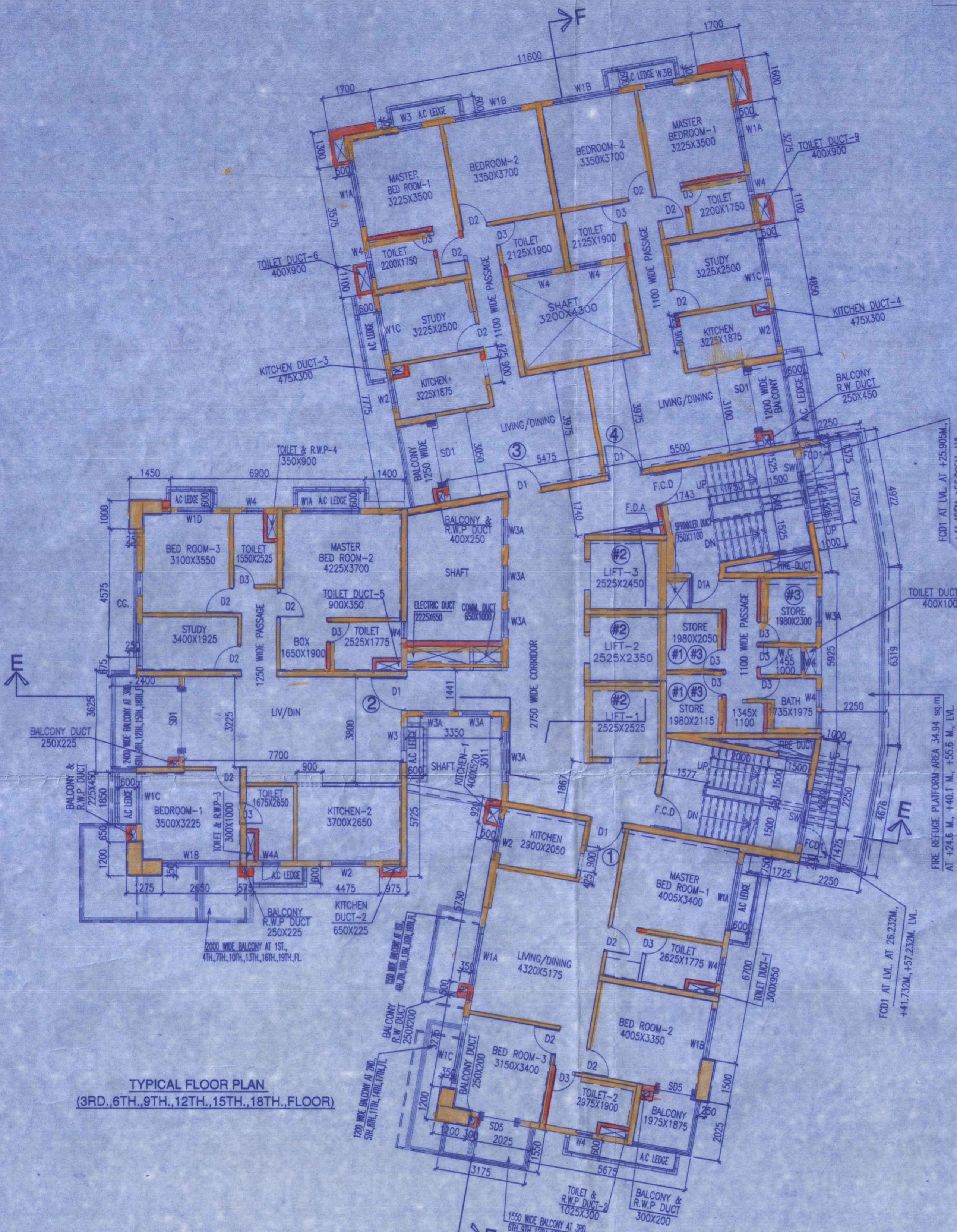
TYPICAL FLOOR PLAN (3RD, 6TH, 9TH, 12TH, 15TH, 18TH, FLOOR)